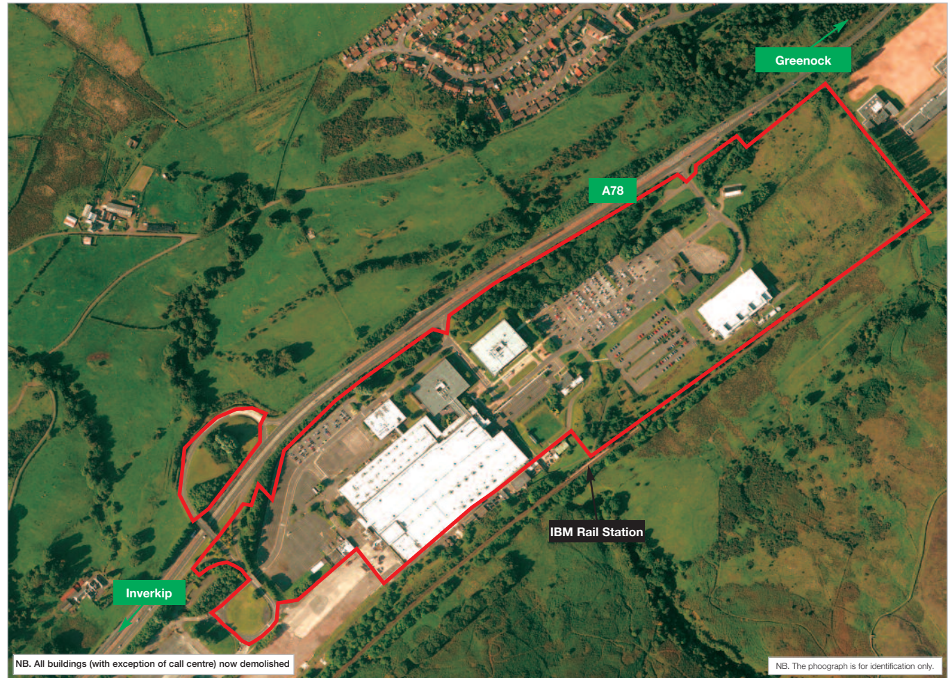
NB. The photograph is for identification only.