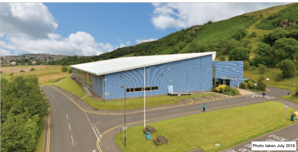
Photo taken July 2016